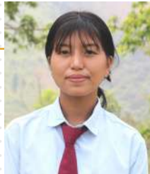
LOAYING O KONYAK