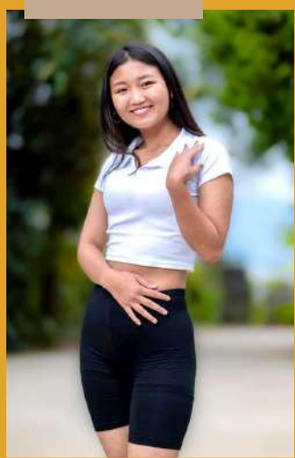
SUBTITLE WINNER : Best Walk (Miss Aboi)

It gives us great pleasure to congratulate our students for participating in Miss Wakching, 2022, Mr. Mon, 2022, Miss Mon, Miss Aboi, 2023