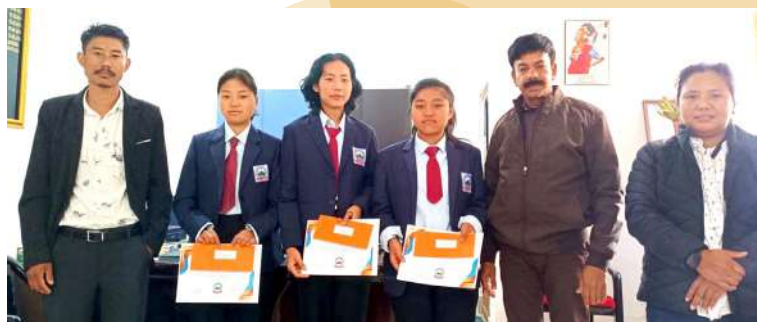
WINNERS WITH PRINCIPAL AND FACULTY