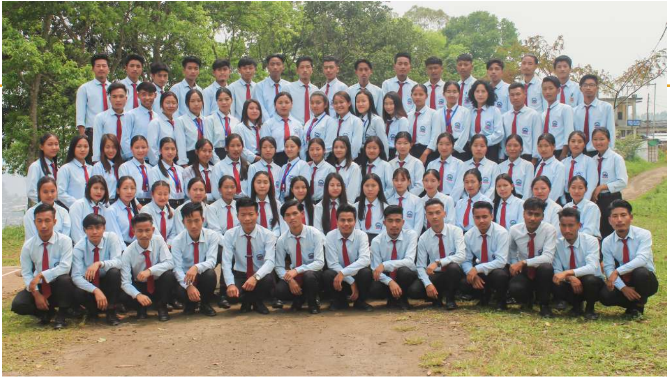
4th Semester Section A