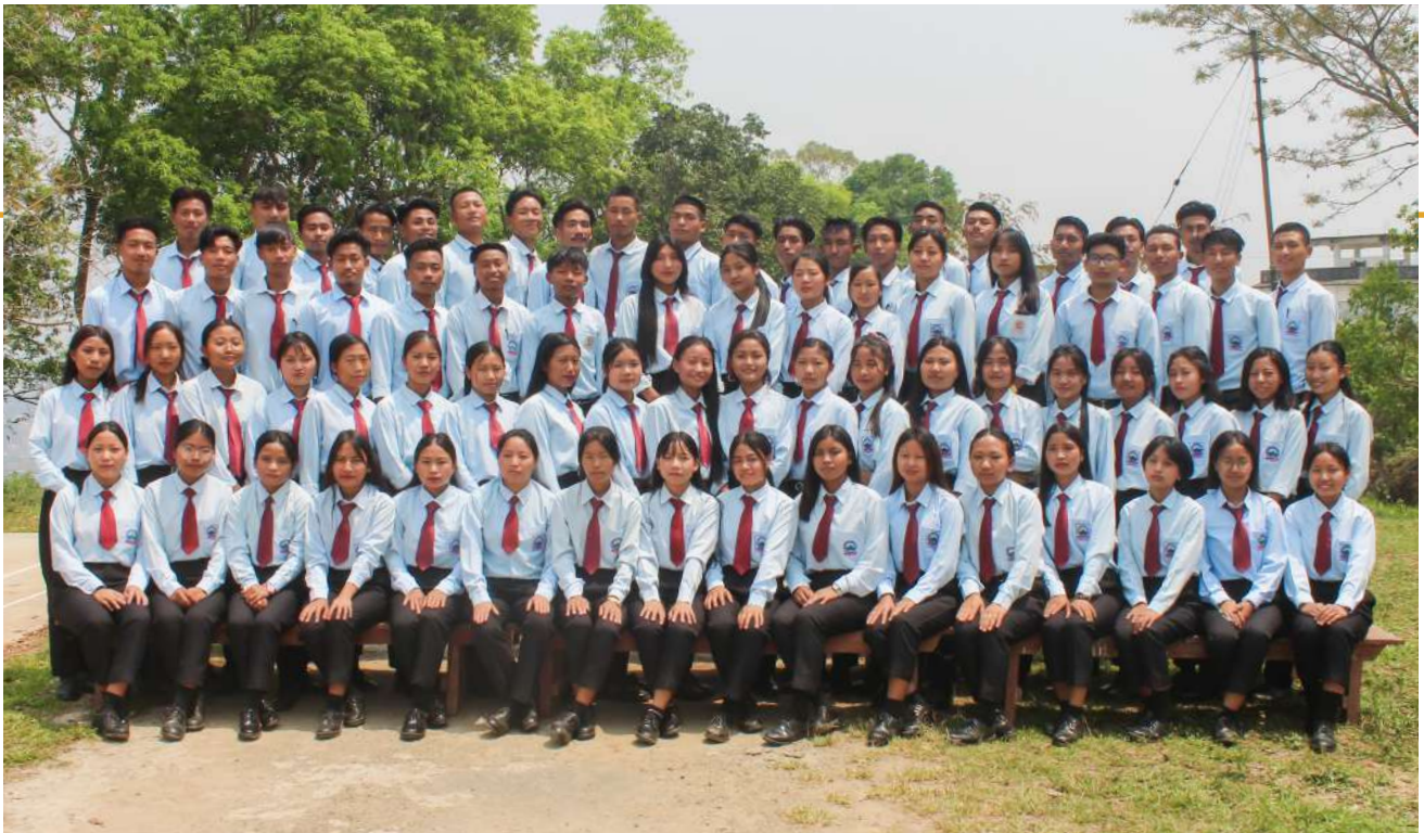
2nd Semester Section A