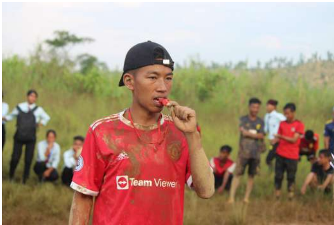
THAT AWKWARD MOMENT WHEN YOU TRY TO WHISTLE AND END UP JUST BLOWING THE AIR ONLY