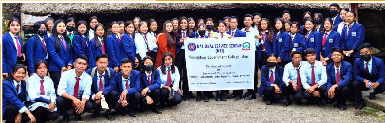
SURVEY AT CHI VILLAGE