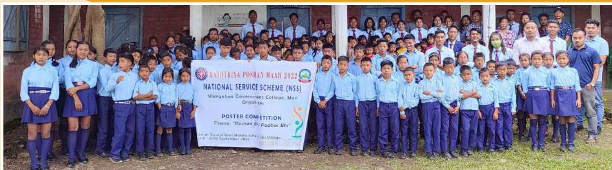
NSS POSHAN MAHA AT CHI ADOPTED VILLAGE