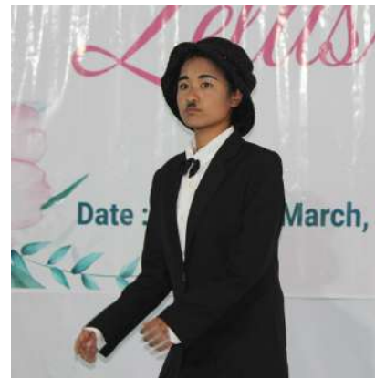
MY REACTION WHEN THE TEACHER ANNOUNCES FOR A CLASS TEST IN THAT UNIT WHICH I HAVE COMPLETELY NO IDEA