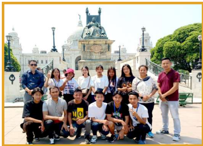
POSING IN FRONT OF THE VICTORIA MEMORIAL