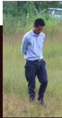
ME SEARCHING FOR THE MOTIVATION TO RUN