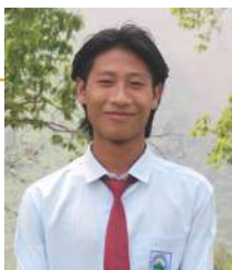
WANKUP Y KONYAK