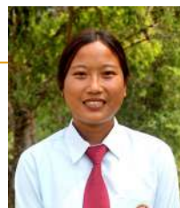
C TOIPO K