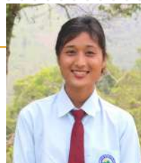
A WANNGAM KONYAK