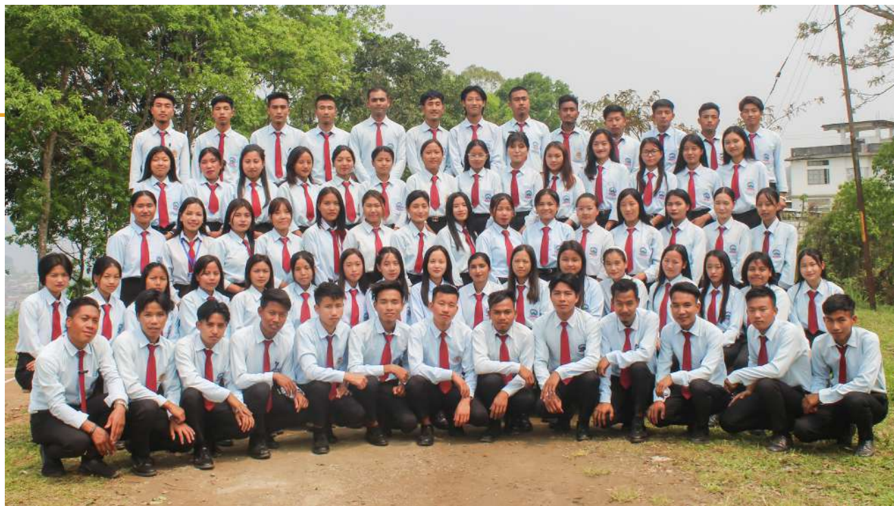
6th Semester Section A