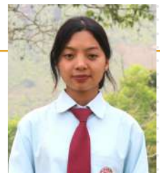
NGEPLYING T KONYAK