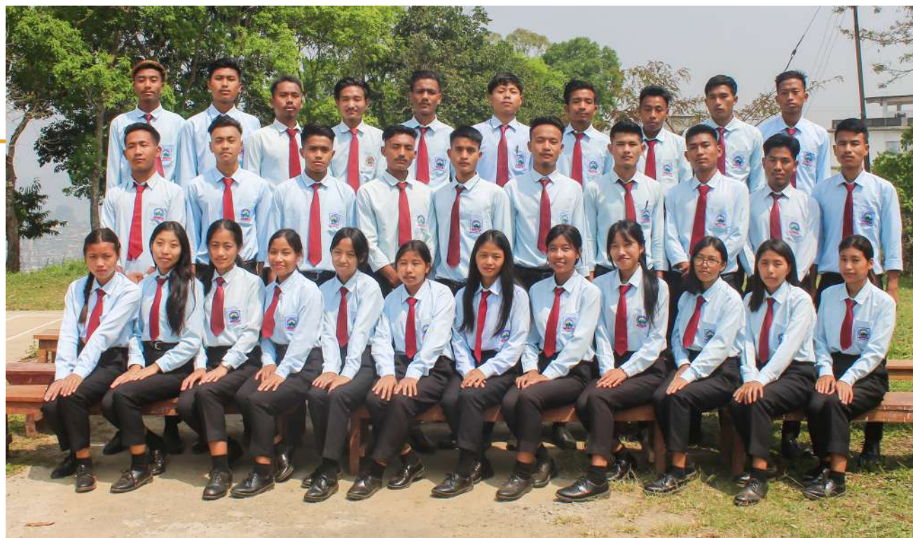
2nd Semester Section C