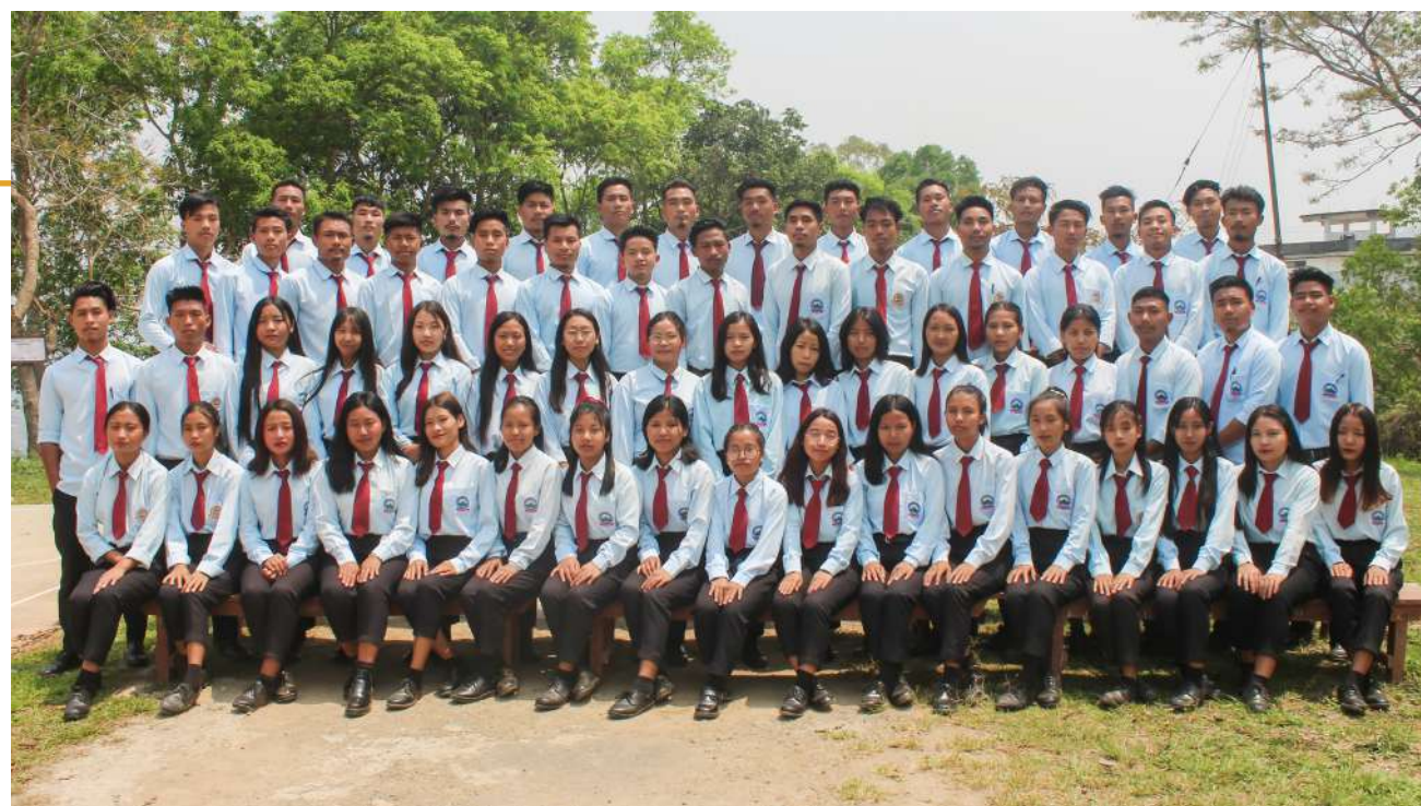
6th Semester Section B