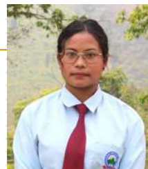
NGEPAM W KONYAK