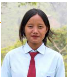
NGAMLIH W KONYAK