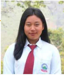
JAIOM W LONGMONGSHEM