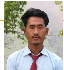
HAMJONG Y L