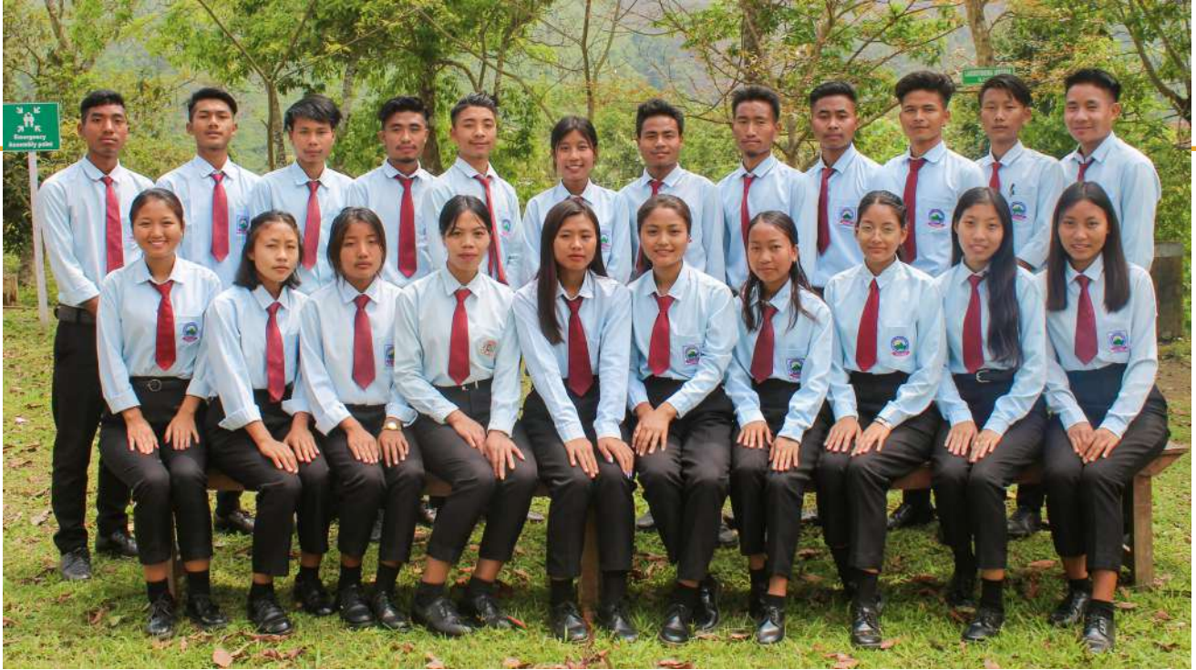
Evangelical Union (EU) 2023-24