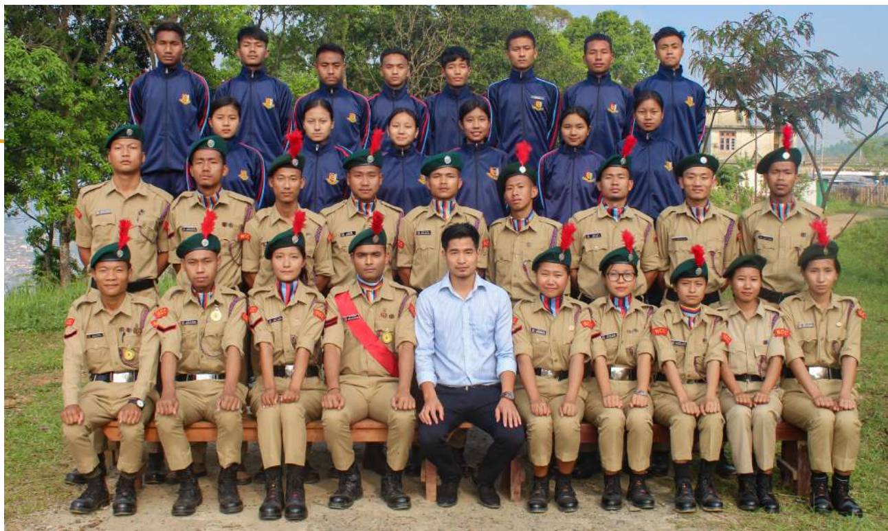
National Cadet Corps (NCC)