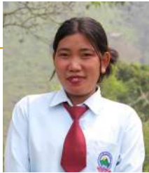
MINCHING Y N