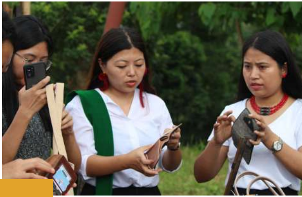
ME LOOKING AT WHAT'S LEFT AFTER PAYING BILLS.