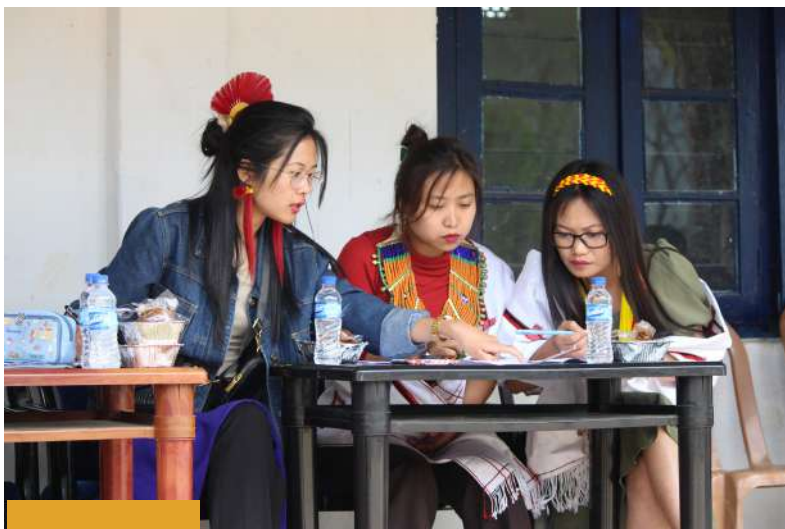
Trying to read your student's handwriting