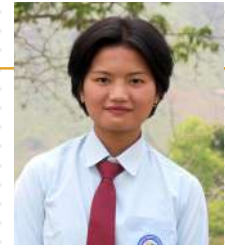
K AJE SUNDAY