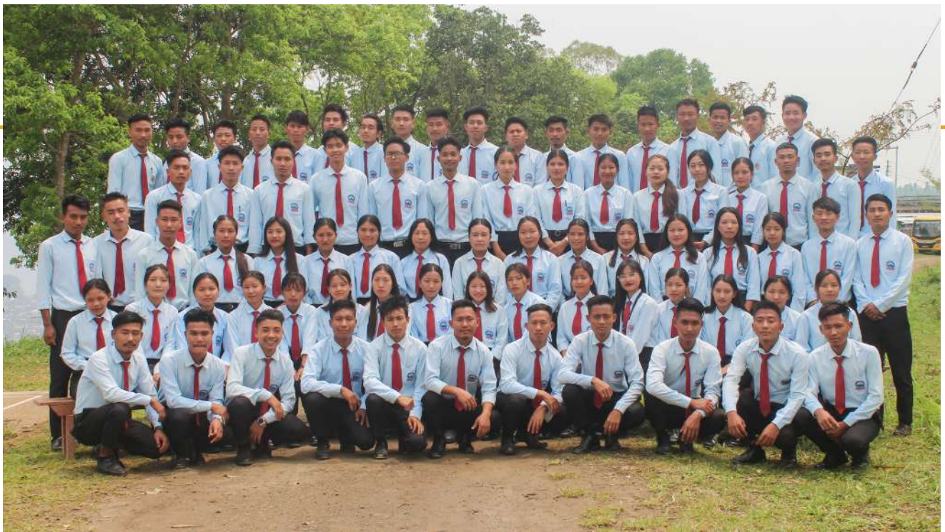
4th Semester Section B