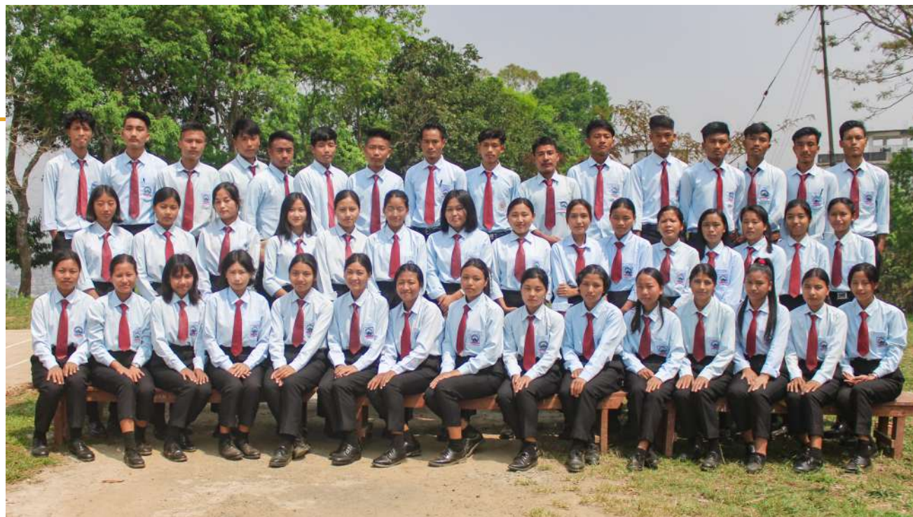
2nd Semester Section B